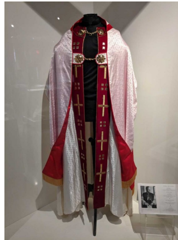
Archbishop Coleman Carroll's liturgical vestments c1958 – 1977 Archdiocese of Miami Collection

Archbishop Carroll's cope is made of white silk in a semicircular shape. It is adorned with two gold brooches on top to fasten the cope. Two velvet panels are attached to the cope, embroidered with golden crosses and square designs.