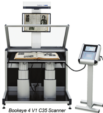
Bookeye 4 V1 C35 Scanner

Opus is compatible with a full line of archive quality scanners.