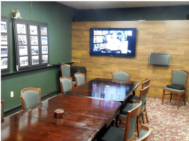
Photo Archives Video Center with oral history playing (Mac Smith) Oct. 2016