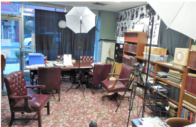
Photo Archives Recording Studio Sep-Oct 2016

After listing all the equipment we would need, we researched the model types, quality, prices, etc., and set forth. We acquired a Canon EOS M3 camera, lavalier microphones, tripod, lighting kits, cables, amplifier, speakers, computer, video cards, and more. Then we decided we needed to construct an electronics wall for viewing the resulting oral history recordings: a 22" touchscreen as a control unit, and a 65" TV monitor, (after measuring viewing distance, etc.), plus the computer, DVD, Blu-ray, and more cables.