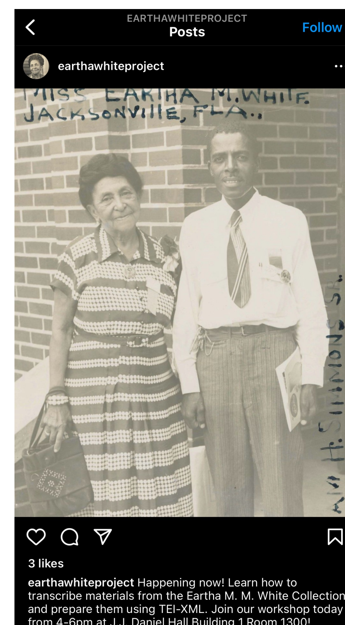
Instagram post by Janaya Ferrer

The project appeals to students from across the campus due to the opportunities it offers to work with archival materials, learn about local African American history, and contribute to processes of cultural heritage preservation and dissemination. Students outside the humanities, in particular, value the type of experiences it provides.