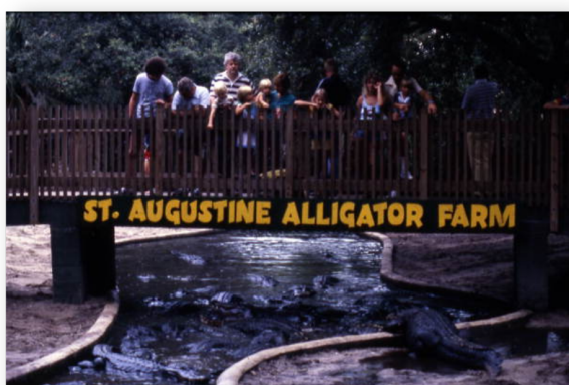
Visitors on the footbridge at St. Augustine Alligator Farm

Miami-Dade Public Library System's Division of Special Collections & Archives holds rare and irreplaceable historical documents for the benefit of the public and scholarly community. The collections we oversee include the Helen Muir Florida Collection, 16mm Film Collection, Cuban Collection of Rare books & Ephemera, Genealogy, Vasari Project, and Rare & Antiquarian books as early as 17th century. It is the primary goal for the collection to provide the public with the contents of the vault, at their request. Its collections include rare books, original manuscripts, over 18,000 photographs, prints, artifacts, audio visual resources, and electronic media. With in-person outreach and events put on hold during the past year, the Special Collections and Archives Department at Miami Dade Public Library System sought out new ways to engage and interact with the public. Through targeted zoom sessions we were able to engage with and educate local teachers and students about using primary sources in the classroom and local history. The success of these programs has inspired a new initiative to continue these sessions as a monthly event that will be crafted to meet the needs of educators.