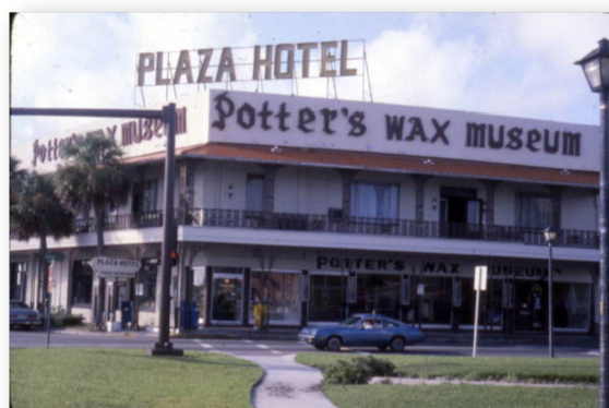
Potter's Wax Museum