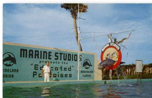
Dolphin leaping through a hoop at Marine Studios