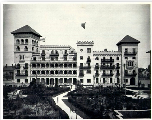
The Cordova. West Façade