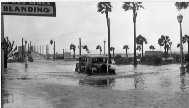
Flooded St. Augustine street after 1944 hurricane