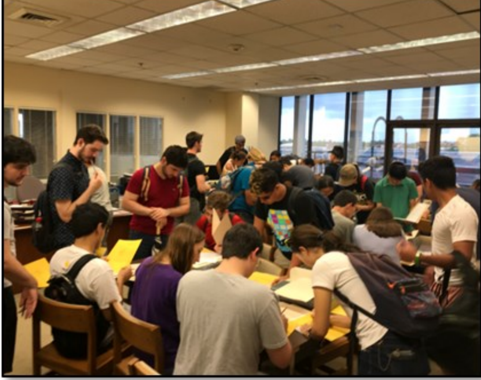
Escape the Library students in SCUA

For the second clue, we wanted to introduce them to Special Collections & University Archives (SCUA). We created a fake collection of newsletters that answered the crossword puzzle (created in Microsoft Excel) that they were given when they entered SCUA. While the collection was fake, the newsletters were copies of real newsletters. We had to create multiple copies of the same fake collection to accommodate the numbers we were expecting. If they filled in the crossword correctly, they'd end up at the LibTech Desk.