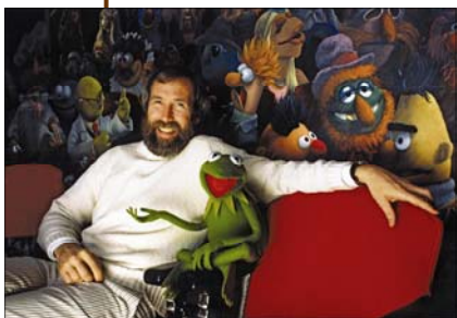
Jim Henson Exhibit

...Orange County Regional History Center, Downtown Orlando, www.thehistorycenter.org ,