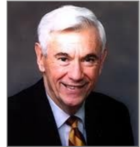
Reubin O'Donovan Askew

Florida State University Libraries announce the availability of two newly processed collections.