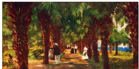
"Strolling in a perfect paradise" at the Henry B. Plant Museum

The Henry B. Plant Museum presents Strolling in a Perfect Paradise through Dec. 31. In October, photographers can enter their best photograph of Plant Park (the former garden spot of the Tampa Bay Hotel) in the Page Photography Contest. The top prize is $250 and a $250 contribution to the Henry B. Plant Museum in the winner's name. The winner's photograph will be on display during the Victorian Christmas Stroll . The top ten finalists will have their photographs displayed on the Museum's website, www.plantmuseum.com , and Facebook page.